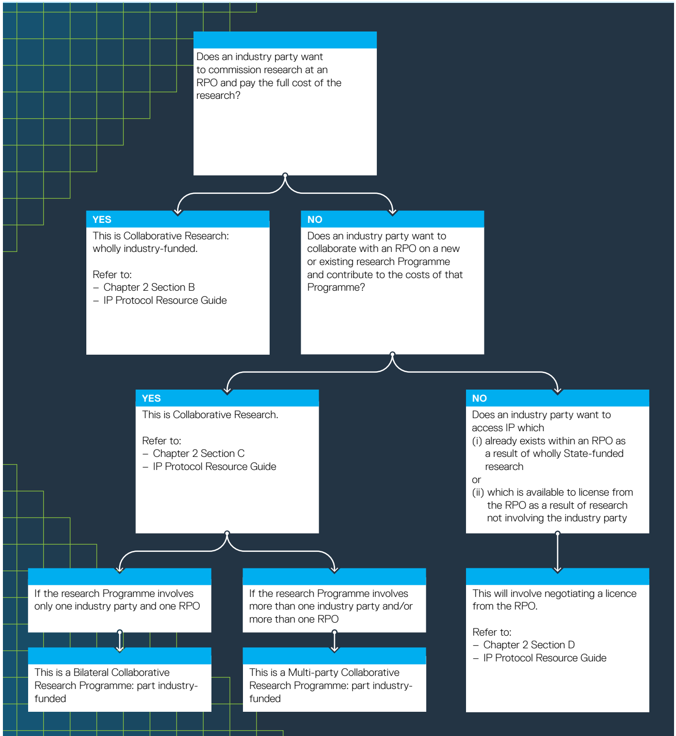
Table 1: Summary of the ways in which industry can access IP from the RPO sector